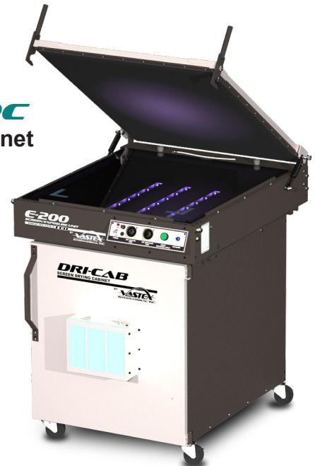
E2-2128-VDC E-200 w/ Drying cabinet