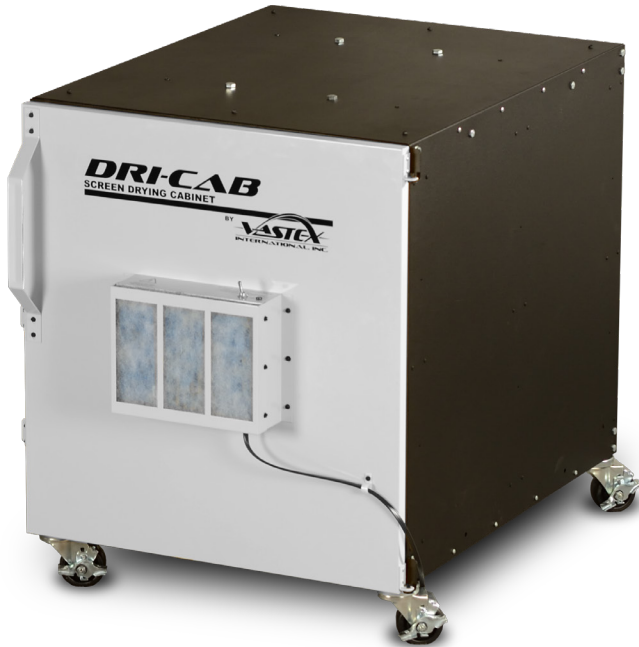
VDC-2331 Holds (10) 23" X 31" (58 X 79cm) screens

Dry your screens securely in the 10 screen Dri-Cab. Powered fan with filtered air flow can have your screens ready for exposure, in as little as 60 MINUTES!**