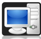
Send To Computer